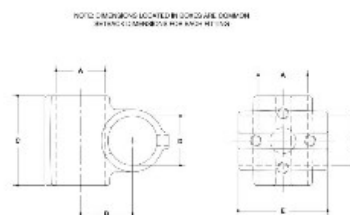
#10-89 Offset Cross