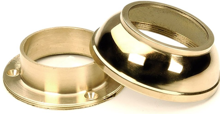
540D Wall Mount Flange and Canopy