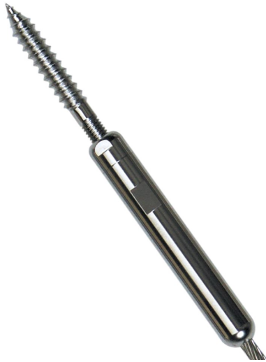
Adjust-A-Body® with Hanger Bolt Tensioner This tensioner screws right into your wooden end post. There is no need for special mounting hardware.