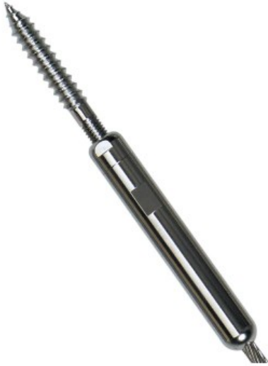
Adjust-A-Body® with Hanger Bolt Tensioner This tensioner screws right into your wooden end post. There is no need for special mounting hardware.