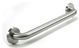
Base flange has 5 screw holes.