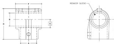
#5-89 Tee SCALE: HALF

NOTE: DIMENSIONS LOCATED IN BOXES ARE COMMON RETAINERS EMPLOYED FOR EACH FITTING