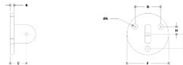
#41M Flange Base

10719 DIMENSIONS LOCATED ALONG THE APPROPRIATE EXTENSION DIMENSIONS FOR EACH FITTING