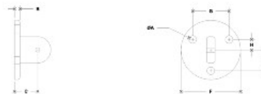
#41M Flange Base

10719 DIMENSIONS LOCATED ALONG THE DIMENSION LINES TO INDICATE THE CORRECT DIMENSIONS