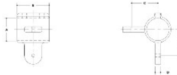
#27M Double Adjustable Side Outlet Elbow or Tee Male Body

FOR DIMENSIONS OF OTHER PIPE SIZES CONTACT BUYRAILINGS FOR SPECIFICATIONS