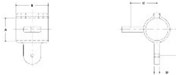
#27M Double Adjustable Side Outlet Elbow or Tee Male Body