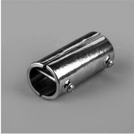
NOTE: DIMENSIONS ARE IN UNITS OF MILLIMETERS DIMENSIONS IN PARENTHESES