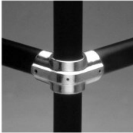
100% ANODIZED ALUMINUM FITTING APPROX. DIMENSIONS FOR REFERENCE