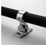
1076 DIMENSIONI CON UNO DEI COMPLETI DATI DIMENSIONALI SE NECESSARIO