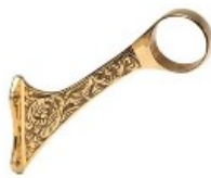
ITEM 00-517/2 VICTORIAN FOOTRAIL BRACKET WITH-OUT SWING LEG