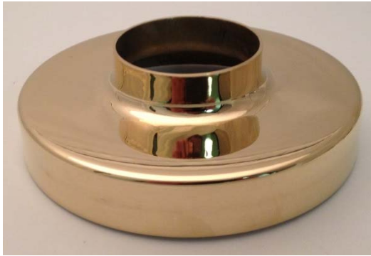
(Design for brass canopies)