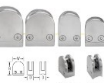
Rubber Inserts for Radius Glass Grips