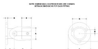
#41 Adjustable Flange (Wall Mount Only)